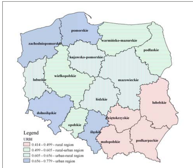
Figure 2. Urbanization index

and the year-by-year reduction of annual contracts by the NHF for public health is the main reason for professionals seeking alternative sources of income. The remuneration received by a doctor with two degrees of specialization, with a PhD in medical science and decades of experience, varies in the amount of 625.00 Euros per month.