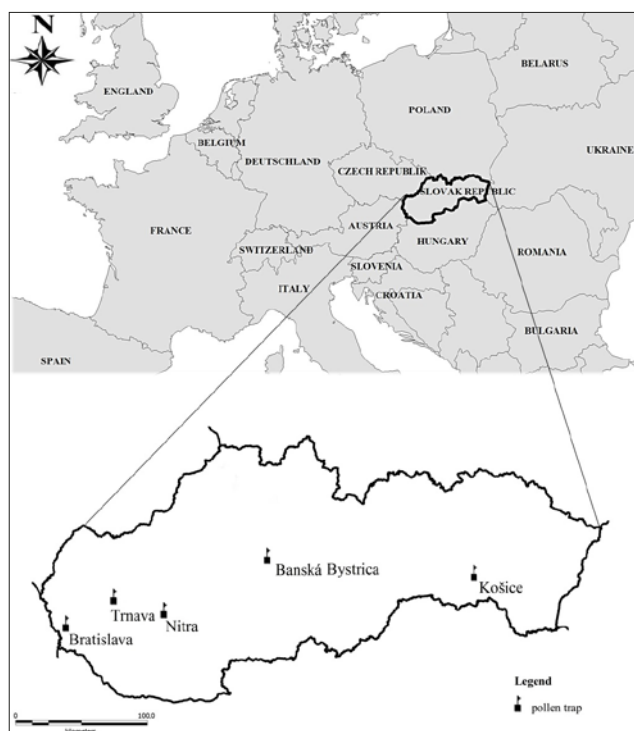
Figure 1. Locations of pollen monitoring stations in Slovakia

The spatiotemporal dynamics of ragweed invasion is evaluated based on: 1) herbarium specimens deposited in the Herbarium of the Department of Botany, Comenius University (SLO), 2) published databases [11, 38] and 3) field investigations carried out during 2004–2014. During the field investigations, potential habitats of A. artemisiifolia , mainly along roads and fields around villages situated in different parts of Slovakia, were inspected. Based on the obtained records, maps indicating the spatial distribution of A. artemisiifolia in Slovakia during four time periods (before 1969, 1989, 2009 and 2014) were compiled.