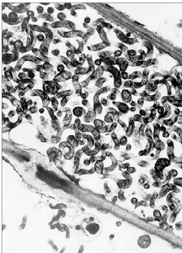
Figure 1. Spiroplasma kunkelii causing corn stunt disease in corn plant

Spiroplasmas lack cell wall and flagellum, and are enclosed within a cholesterol-containing single membrane. The tubular cell has an internal cytoskeleton composed of contractile fibrils which function as linear motors and enable the characteristic, twisting motility. Spiroplasmas are Gram-positive, and are cultivable in nutrient rich media. They have a low guanine (G) plus cytosine (C) content of their genomic DNA (25–30%), and very small genomes ranging from approximately 0.78 – 2.20 Mb in size [4, 6, 7]. Currently, 34 serological groups of spiroplasmas are recognized; 3 of these groups encompass 15 subgroups of inter-related strains. To date, circa. 40 Spiroplasma species among all serogroups