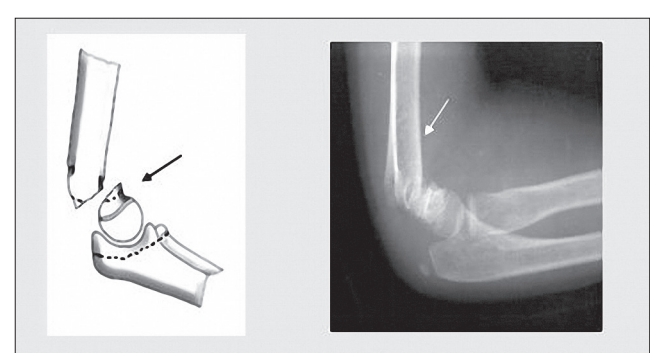
Figure 3. Flexion type of the supracondylar fracture of the humeral bone.

Among the patients in the presented study, there were 8 boys and 1 girl. The fractures concerned 6 left limbs and 3 right limbs. In type II fractures, no statistical analysis were