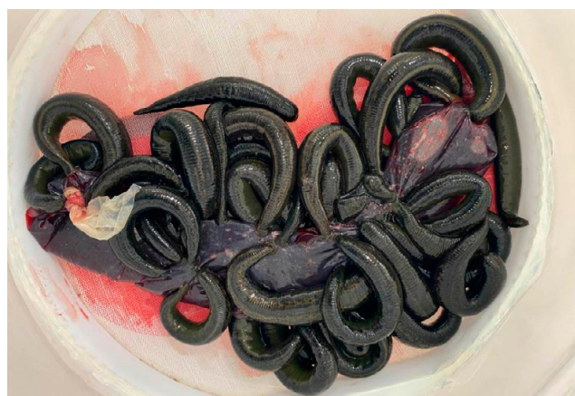
Figure 1. Reproductive leeches feeding on Hepatitis B-infected blood preheated to 36–37°C within a dried intestine setup

Acquisition and feeding of leeches. A total of 52 reproductive leeches, weighing between 2–4.2 grams, were obtained from the Medical Leech Breeding and Research Laboratory of Kırşehir Ahi Evran University Faculty of Medicine. Prior to the experiment, the leeches were starved for a period of 3 months to prepare them for the study. Following the 3-month fasting period, feeding blood, preheated to 36–37°C, was introduced into the dried intestine, which was then placed in the container housing the reproductive leeches. This setup allowed the leeches to attach themselves to the surface of the intestine and feed effectively (Fig. 1).