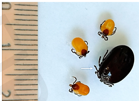
Figure 2. Engorged female of Dermacentor reticulatus (arrow) collected from a dog's head in Radomsko in October 2010 (scale in cm)