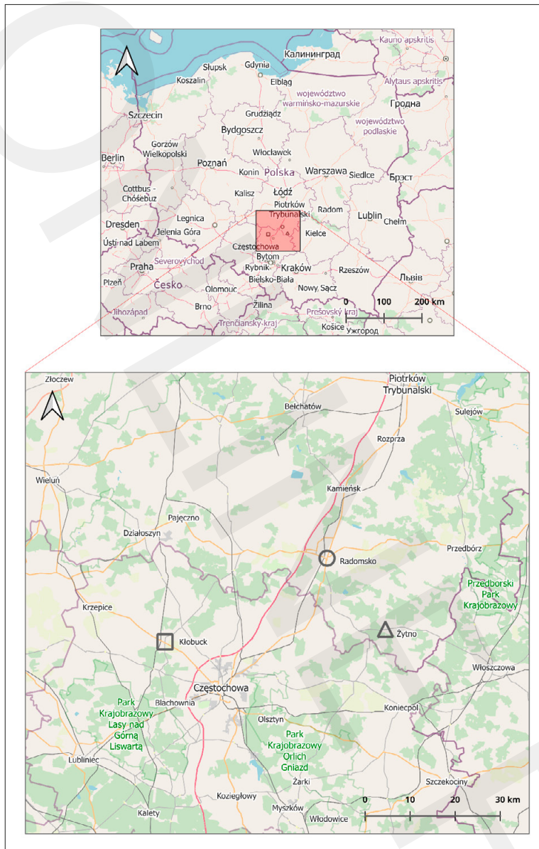
Figure 1. Geographical locations in Poland where Dermacentor reticulatus ticks were found on companion animals in 2010–2014.

O- 51°04'01"N, 19°26'41"E, 223 m a.s.l.; - 50°54'02"N, 18°56'12"E, 239 m a.s.l.; Δ- 50°55'38"N 19°37'39"E, 202 m a.s.l.