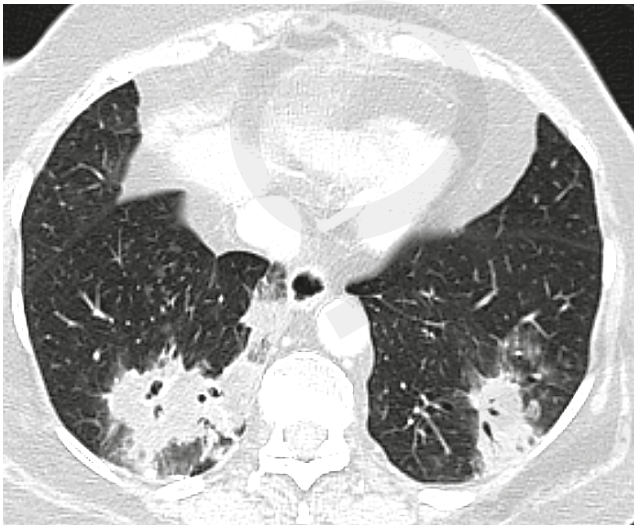
Figure 1. Bilateral lung consolidations surrounded by ground-glass opacity