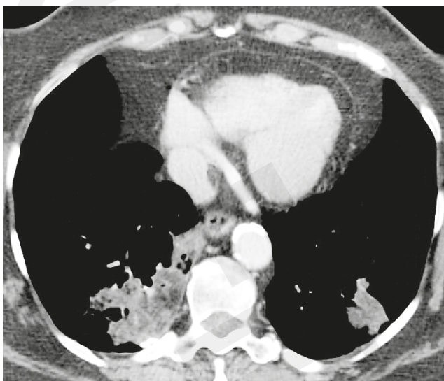
Figure 2 and 3. Areas within the consolidations showing low density (resembling fatty tissue)

Additional history obtained after completing the diagnostic tests revealed that the patient had been inhaling liquid paraffin oil for several years to manage xerostomia. Consequently, the diagnosis of exogenous lipoid pneumonia (ELP) was confirmed.