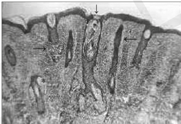
Figure 3. The skin of the left retroauricular area of a 42-year-old man after 14 years' exposure to PCBs. Hyperkeratosis in the follicle opening in the middle, with the formation of comedones, loss and disappearance of the sebaceous glands, disappearance of sweat glands, and spheric cellulisation in the corium, with the maximum around hair follicles (magnification 52x)