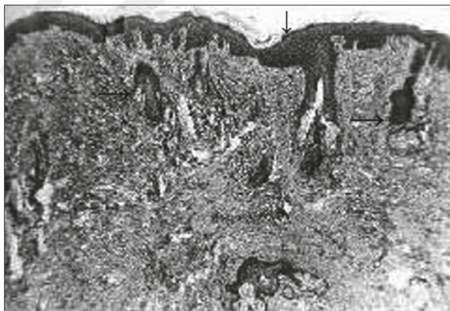
Figure 4. The skin of the left retroauricular area of a 42-year-old man after 14 years' exposure to PCBs. Mild surface hyperkeratosis and signs of acanthotic extension of epidermis, noticeable decline to disappearance of the sebaceous glands, absence of sweat glands, and perifollicular spheric cellulisation (magnification 52x)