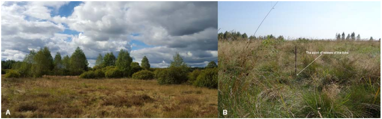
Figure 1. A- Dermacentor reticulatus habitat studied. B- central part of the experimental plot on which ticks were released

Ticks in each group were marked with a different colour. In total, 800 hungry D. reticulatus adults – 400 females and 400 males – were marked.