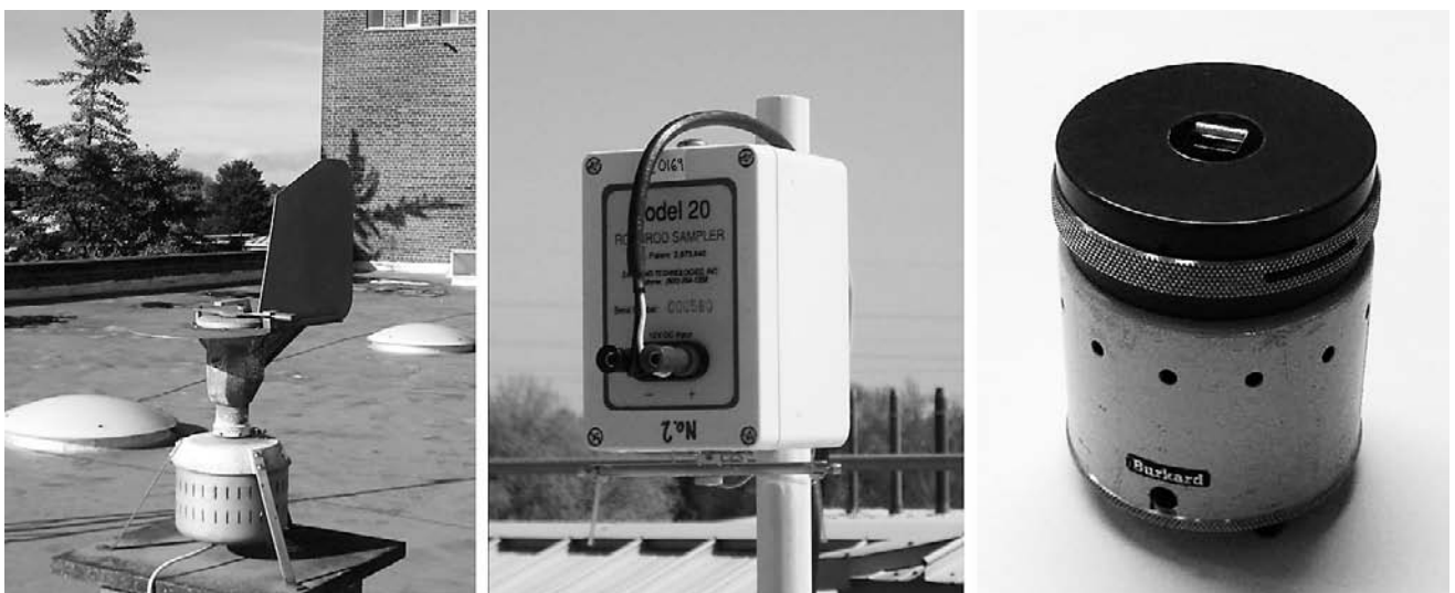
Figure 1. The three bioaerosol samplers used in the study: 7-Day sampler (left), Rotorod (middle) and PVAS (right)

Experimental sites. The study was performed at two different sites over three years, however the methods employed were equivalent. Urticaceae data were collected at the University of Worcester, UK, during August 2010. The three samplers were set up in a linear array on the large flat roof of the Institute of Science and the Environment, 9.5 m above ground level, with the 7-Day sampler in the middle and the two mobile samplers approximately 1 m to either side. All three instruments were a minimum of 4.5 m from the edge of the roof. The 7-Day sampler is part of the UK national pollen monitoring network and is in continuous operation all year round. It stands on a concrete plinth with its orifice 1.22 m above the roof. The Rotorod was mounted on a vertical stand and the PVAS in a specially designed cup-shaped holder on top of a tripod, with the sampling points of both devices at the height of the 7-Day sampler's inlet. Weather data were collected with a