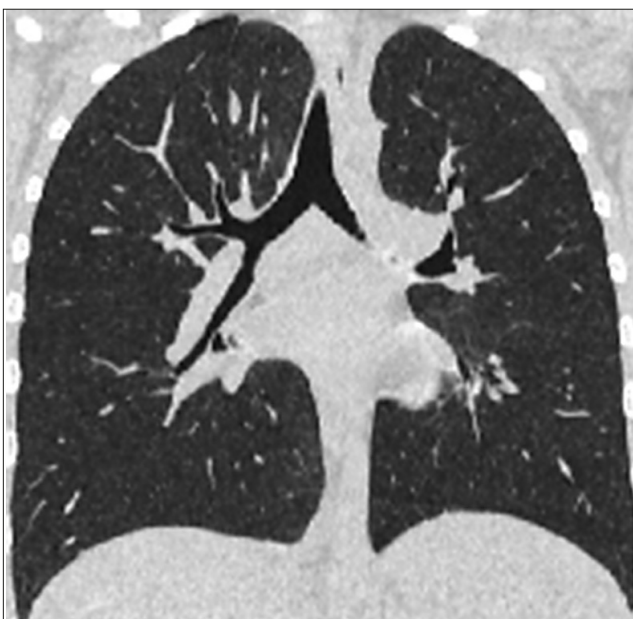
Figure 1. High-resolution computed tomography of the chest. Coronal and transverse section. Generalised discrete reticular opacities and poorly defined centrilobular and subpleural nodules

investigation was performed. The advice to stop exposure to the suspected trigger factor, i.e. pigeon faeces antigens, had a crucial influence on the further course of the disease and the patient's prognosis.